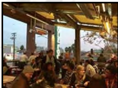
Busy night at Floodcraft Brewing