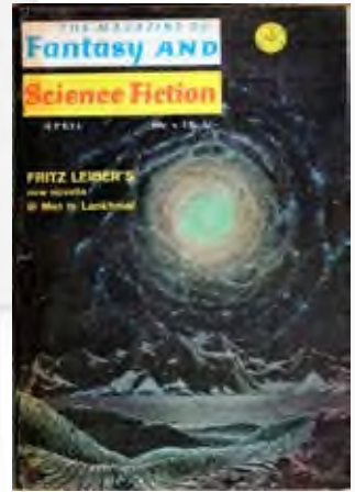
Front cover artwork by Chesley Bonestell, 1970.