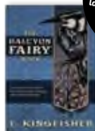
THE HALCYON FAIRY BOOK by T. Kingfisher