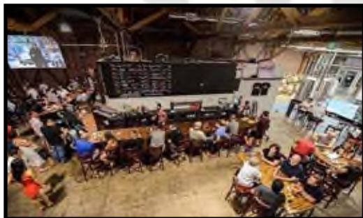
Uproar Brewing Company, Downtown San Jose

The craft brewing movement has gained a lot of momentum in recent years, and San Jose is no exception, with eight fine craft breweries quenching the thirst of residents and visitors in central San Jose. Thirsty Worldcon attendees can find three breweries within a mile of the convention center. The rest are within three miles.