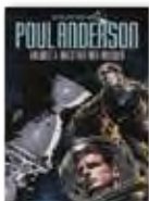
QUESTION AND ANSWER: The Collected Short Works of Poul Anderson (Volume 7)