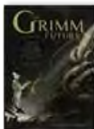
THE GRIMM FUTURE Edited By Erin Underwood