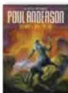
CALL ME JOE: The Collected Short Works of Poul Anderson (Volume 1)